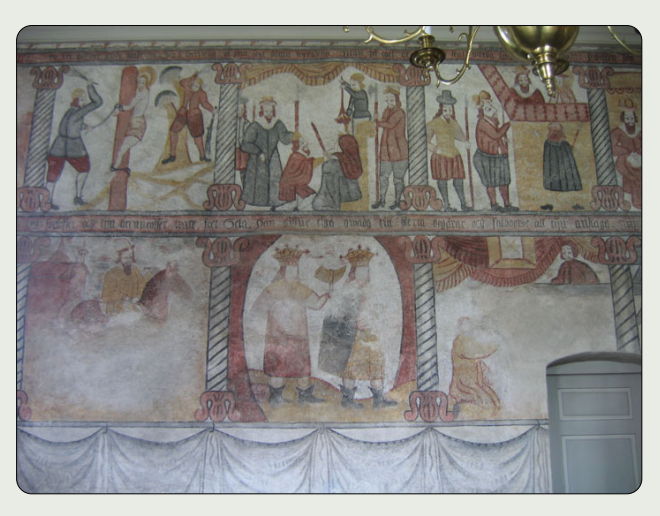
17th century paintings on the northern wall of the nave, depicting scenes from Jesus' life and death.