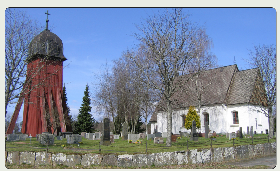
Hagshult Church and bell tower seen from the south-east. On September 30, 2020, the bell tower was destroyed by fire. According to the church's accounts, it had been erected in 1684 Photo: Jönköping County Museum.

The pulpit was built by the master builder Lars Wennerholm from Svenarum parish and installed in 1807. In the 1880s, the entrance to the church was moved from the southwestern corner to the western gable, and a porch was added. Around 1900, the traditional shingle roof was replaced with differently coloured cement tiles. These were laid in a pattern forming three H's. This has been interpreted as "the Lord's House in Hagshult". In 1994, the cement tiles were removed, and the church was once again given a traditional slate roof.