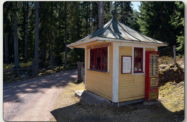
A 1920s newspaper kiosk from Tranås welcomes the visitor to Hultet.

Please note that Hultet is only open for visitors during the summer months, with guided tours by the association Friends of Hultet. Parking and a turning area for buses are available. There is wheelchair access between the various buildings, but indoors there are high thresholds and steep stairs. See also http://www.gammelbynhultet.se/ .