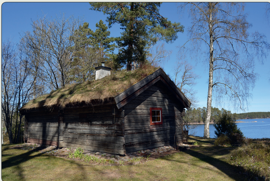
One-room cottage from Näsä in Asby parish, built in the 18th century and furnished with authentic objects.

N 6441030 / E499525 (SWEREF 99 TM) // N 58° 06' 38,45, E14° 59 28,90" (WGS84)