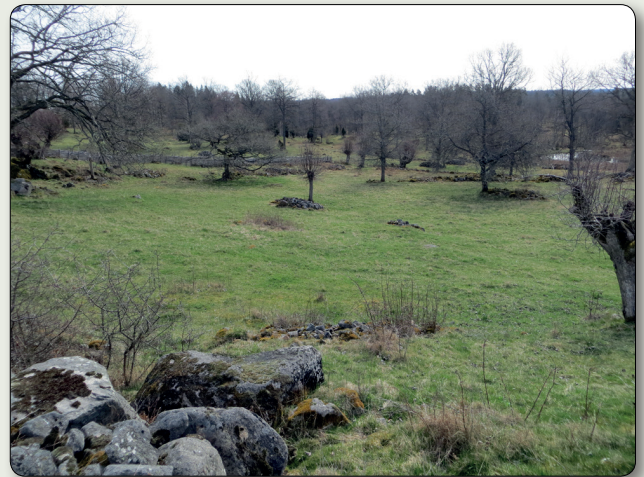
The traditionally managed ground contains pollarded trees, i.e. leaf-bearing twigs, and branches have been cut for winter-fodder for the cattle.

In the south-western part of the village there is a cowshed, which houses a museum with old agricultural and household implements from the village.