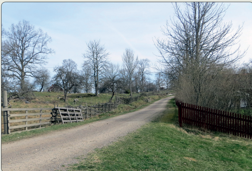
The old village plot, which was abandoned around 1820, was located along the road in the background of the picture.

N 6354778 / E 529739 (SWEREF 99 TM) // N 57° 20' 5.770", E 15° 29' 38.387" (WGS84)