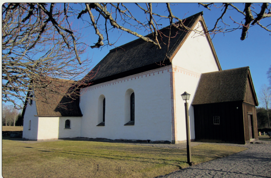
The church and portal seen from the south-east.

Coordinates: N 6359428 / E 491953 (SWEREF 99 TM) // N 57° 22' 39.36", E 14° 51' 58.21" (WGS84)