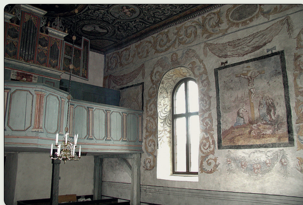
Parts of the interior with the 17th century organ and wall paintings from the 18th century.

With its preserved Romanesque paintings in the chancel, an interior strongly characterised by 17th and 18th century style ideals, ancient organ, and grave monument from early Christianity, the church is well worth a visit.