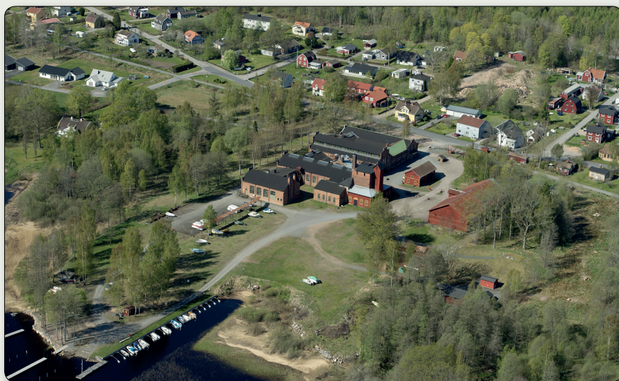
Åminne Works seen from the north-east.

Coordinates: N 6331687 / E 440124 (SWEREF 99 TM) // N 57° 7' 28.47", E 14° 0' 39.69" (WGS84)