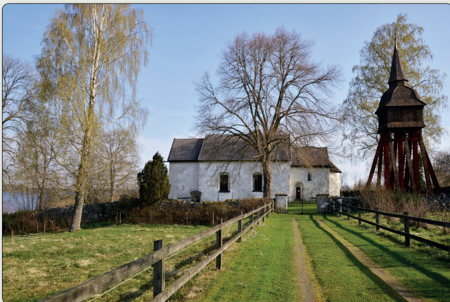
Vallsjö Old Church with its typical medieval exterior.

N 6361185 / E 485676 (SWEREF 99 TM) // N 57° 23' 35.63", E 14° 45' 42.06" (WGS84)