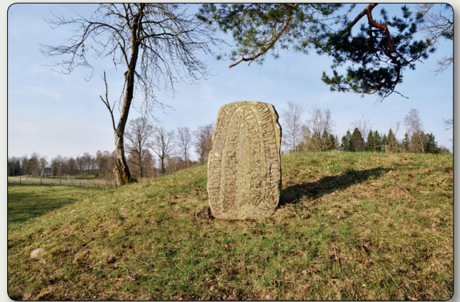
“Väste (Visäte) and Ivar (or Joar) and Sylva, three brothers, built this bridge and erected this stone in memory of, their father”, is the inscription on the rune stone.

Around 250 metres south-west of the church is a rune stone (Sm 80) on a small mound just south of the old road. This is one of the around 10 known “bridge stones” in Jönköping County. It was previously located around 1.5 kilometres further south by the so called Runnkärret bog, where there was once a “corduroy road”. The stone was removed in the 1820s to be used as a stepping stone, but was erected in its present place in 1938.