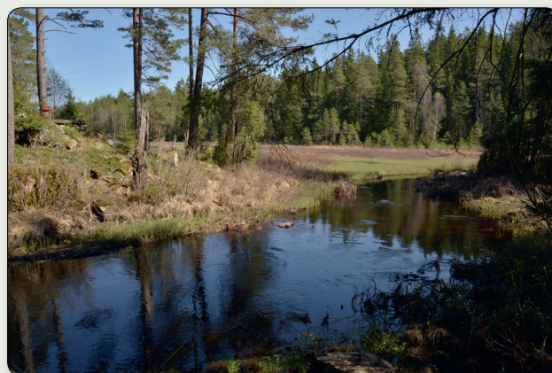
Dam upriver of the log flume.

On site, there is an information board where you can read about the log-driving history of the river. A fireplace has been prepared where you can eat your picnic and enjoy the beautiful countryside.