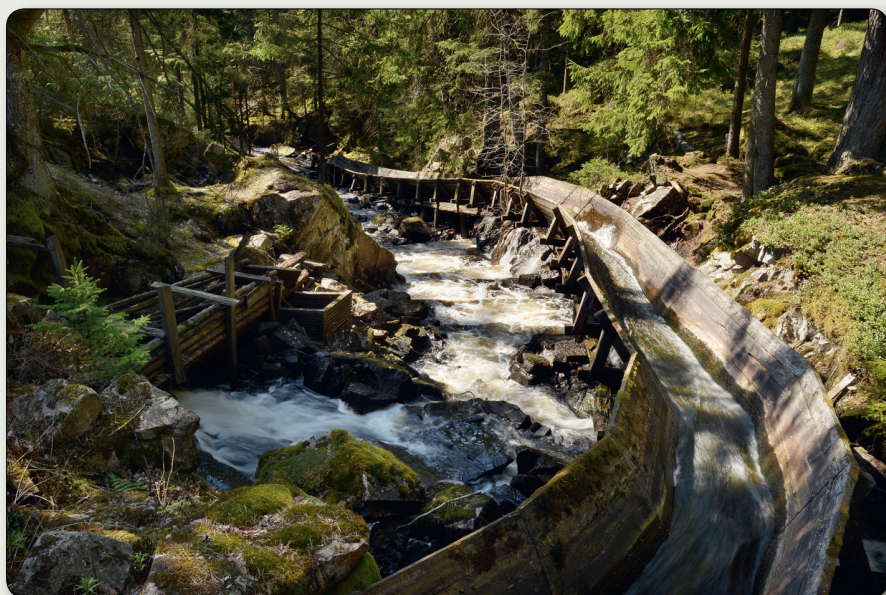
Restored log flume in the river Valån.

Coordinates: N 6369208 / E 422981 (SWEREF 99 TM) // N 57° 27' 32.38", E 13° 42' 58.56" (WGS84)