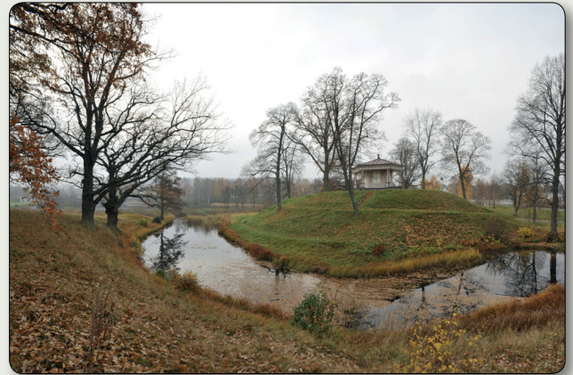
Rumlaborg Castle was built in the 1360s on land belonging to the Humblarum village and became a centre of power in a castle fief into the 16th century.

Today, the ruins comprise a castle hill surrounded by three ditches and ramparts. On the hill is a gazebo built in 1845, and which for a time served as a library for the Rosendala estate. Finds from archaeological investigations at Rumlaborg in the 1930s are displayed in Huskvarna Town Museum in the Kruthuset building.