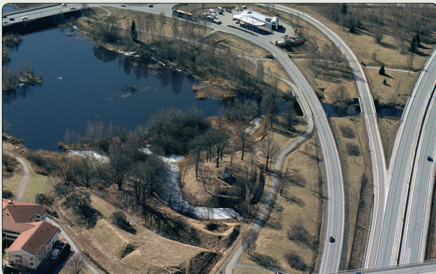
The ruins of the medieval Rumlaborg Castle in today's urban environment in Huskvarna, by the Huskvarna river.

Coordinates: N 6405752 / E 456418 (SWEREF 99 TM) // N 57° 47' 30.01", E 14° 16' 0.93" (WGS84)